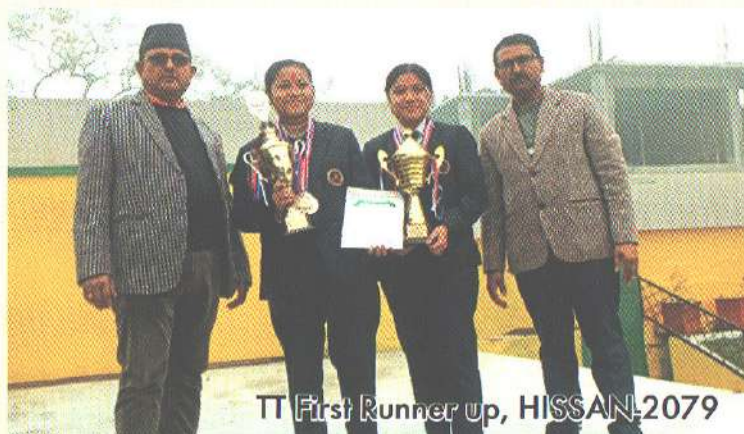
TT First Runner up, HISSAN-2079