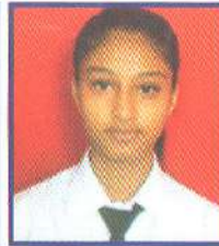
Siksha Nepal BIM-HDC, Biratnagar